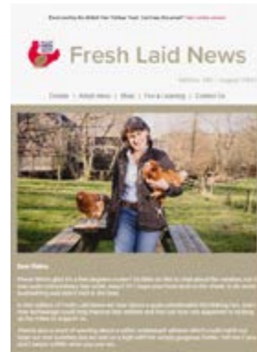
Fresh Laid News

Sponsoring partners are also featured on a page dedicated to acknowledging their support and linking back to their sites.