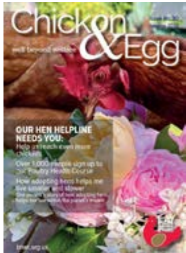
Chicken & Egg

Chicken & Egg is the British Hen Welfare Trust's flagship magazine with a combined circulation of 100,000+ households (10k print copies/30k online views monthly/60k online subscribers) and a readership of c.125,000 and can be read online at bhwt.org.uk which has 90,000 page views per month.